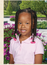
Wallet Magnets (4)