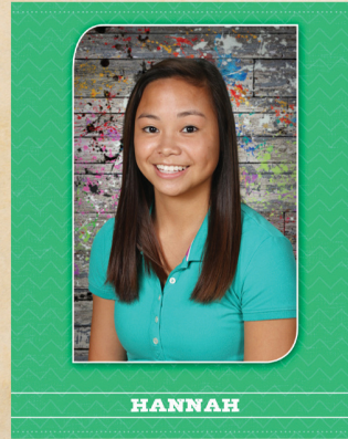
5x7 & 8x10 Border Prints

SPRING ORDERS ARE PREPAID!!! YOU DO NOT GET A PROOF FOR SPRING!!! Please send in the form with your student on picture day.