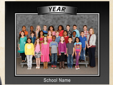
School Name 8x10 Class group