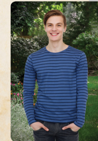
4x6 Aluminum Desk Print